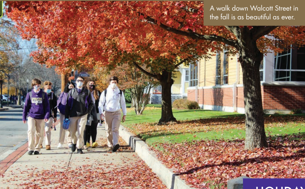
A walk down Walcott Street in the fall is as beautiful as ever.