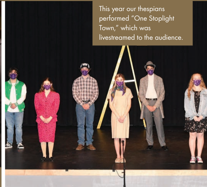
This year our thespians performed "One Stoplight Town," which was livestreamed to the audience.