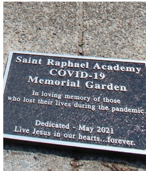
A garden dedicated to those lost from COVID was dedicated outside the former Brothers' residence on Walcott Street.