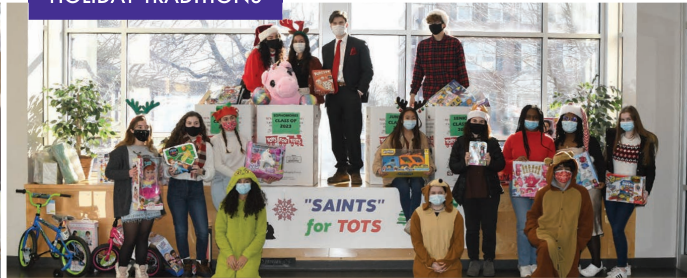
The annual collections for Thanksgiving baskets and Toys for Tots showcased Saints' community service at its best.