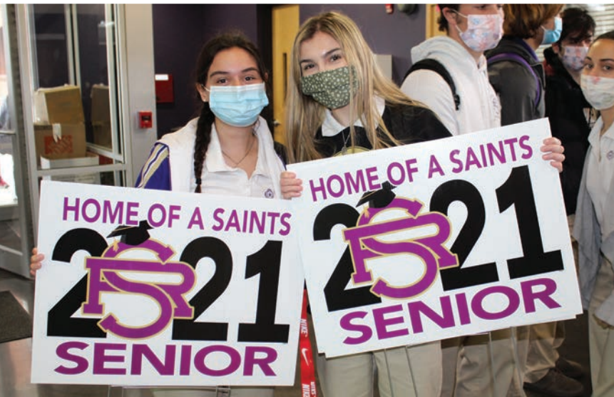
Seniors pick up their lawn signs in the spring to advertise their Senior Saint status.