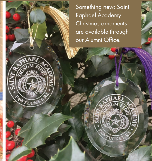
Something new: Saint Raphael Academy Christmas ornaments are available through our Alumni Office.